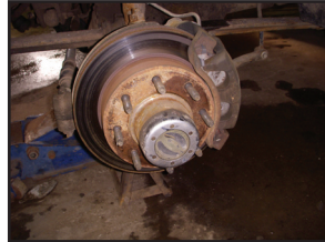
3. Remove manual locking hub (This is a Warner Hub Assembly).