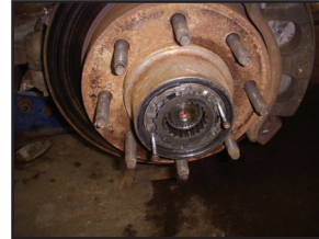
4. Put two screws in as shown. Push in to release tension spring.