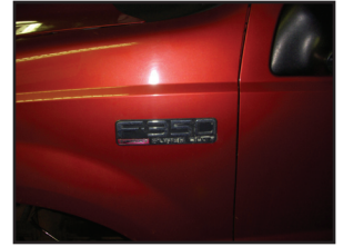
1. 1999 Ford F-350 Pickup Crew Cab Diesel 7.3 LTR