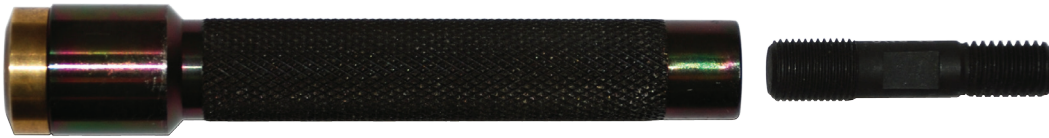
Ford and Dodge 4WD Hub Tool