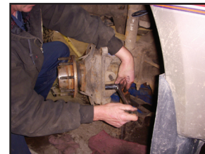
12. Remove the nuts holding the bearing assembly. The nuts are 21 mm thin wall socket.