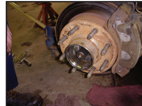
8. The hub is now removed.