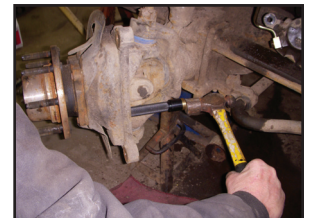
13. Turn steering wheel to the right and tap on the tool. Turn back to the left and tap again. Go back and forth until the bearing is removed.