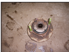
14. Bearing assembly.