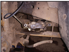
10. Support caliper to protect brake hose using a bungee cord or set on leaf spring.