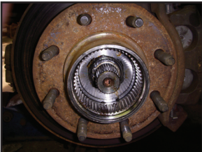
6. Remove snap ring from axle shaft.