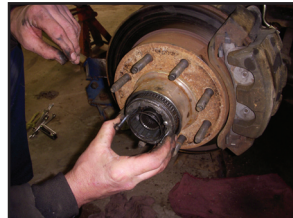
7. Pull the hub out.