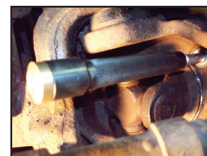
16. The U-joint had to be turned out.