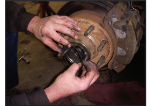
5. Remove spring clip.