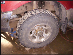
2. Remove lug nuts and wheel.