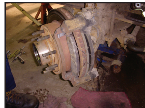
11. Remove the brake rotor.