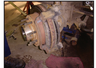
9. Remove caliper and caliper mount.