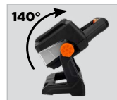
140° Vertical Rotation