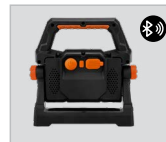
Bluetooth* 4.0 Range: 10 M (32') (Compatible with android and IOS)