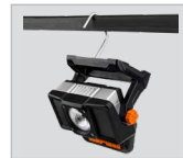
Hanging steel hook in base