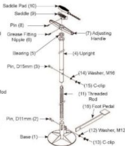
Figure 2 - Model MPS1500PA Components