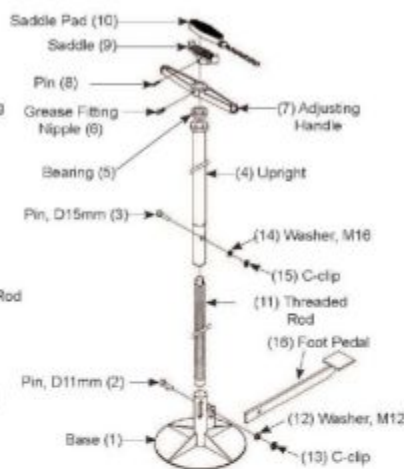
Figure 2 - Model MPS1500PA Components